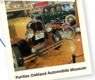
Pontiac Oakland Automobile Museum