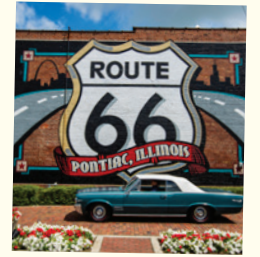
Route 66 Hall of Fame & Museum

As you pull into the City of Joliet, make sure to look for the ornate Rialto Square Theatre . This movie house, which opened in 1926, is considered to be one of the most beautiful theatres in the world. Harrah's Joliet Casino and Hotel is home to table games, slot machines, and an exquisite steakhouse, The Reserve . Make a reservation to enjoy a magnificent meal as part of the fun entertainment inside Harrah's. Your hotel room waits down the hall in the next tower, and you'll want to rest up - your next day is a busy one!