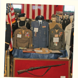
Livingston County War Museum & Education Center