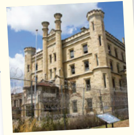
Old Joliet Prison