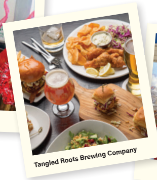
Tangled Roots Brewing Company