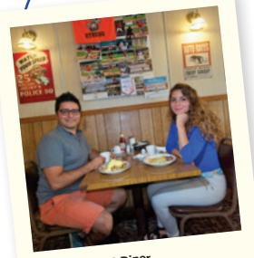
Joliet Route 66 Diner

By now, you've worked up a great appetite. There's one challenge left - The 1-lb Nick Burger. Lemont's Nick's Tavern burger has been voted best along the I&M Canal for several years, and you'll see why (don't worry, there are smaller burgers available too). Get a Pollyanna Beer or PBR to help wash it down. Ready for rest? Call it a night (and an end to a true adventure) by settling into the Aloft Bolingbrook .