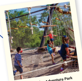
Lemont Quarries Adventure Park