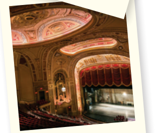
Rialto Square Theatre