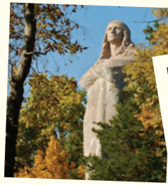
Black Hawk Statue