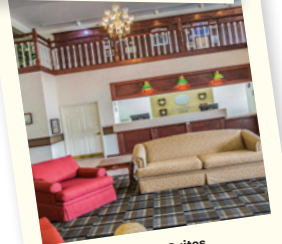
Dixon Quality Inn & Suites