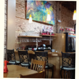
Crystal Cork Wine Shoppe

Put on your shades, casual clothes and sunscreen for a day on the river! A scenic 45-minute drive takes you to Savanna, located on the Mississippi River. cSavanna Adventures will be waiting to welcome you for a four-hour tubing trip that provides transportation, tubes and life vests for your adventure! Relax and enjoy the view as you float by some of the most gorgeous spots along the river. Once you are back on dry land, check in at the Savanna Inn and Suites to freshen up and then head out to take in the fun atmosphere of downtown Savanna. Here, you can stop by Savanna Marketplace, River Valley Designs, Sassy Stems, Frank Fritz Antiques and Iron Horse Social Club. Circa 1888 is the perfect spot for a farm-to-table dinner while enjoying sunset views overlooking the Mississippi River on the deck. Check out the local nightlife that usually includes live music or retire to Savanna Inn & Suites.