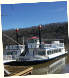
Pride of Oregon Paddle Wheel Boat