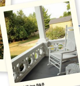
Pinehill Inn B&B